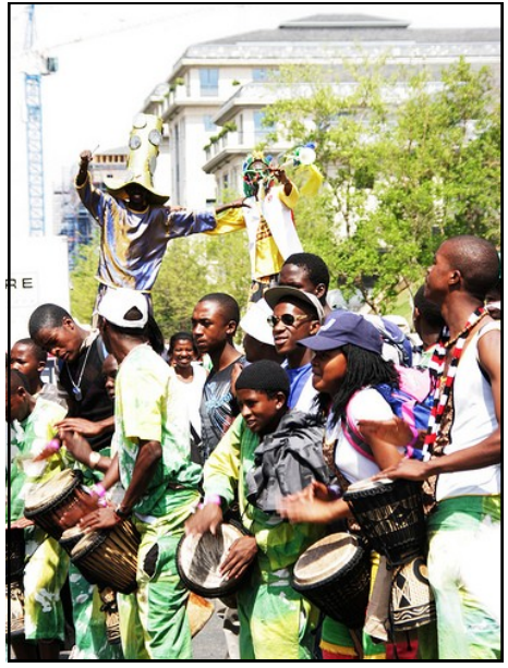
Drummers parade through the streets during a previous Joburg carnival

Wonke umphakathi uyamenywa ukuba ube yingxenye yalo mcimbi. Nicelwa ukuba nigqoke imvunulo yenu yesintu (Traditional Garments), niphathe yonke imitshingo eninayo kusukela kumavuvuzela, izimpempe, nezigubhu, nakho konke eninako, ukuzokwenza lomcimbi ube womnandi nothokozisayo.