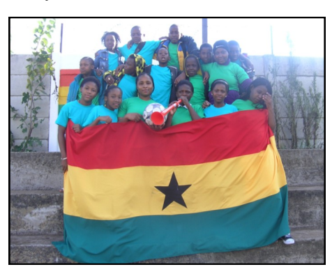
Ghanaian fans show their support

That time, my loves, is here. We are ready.